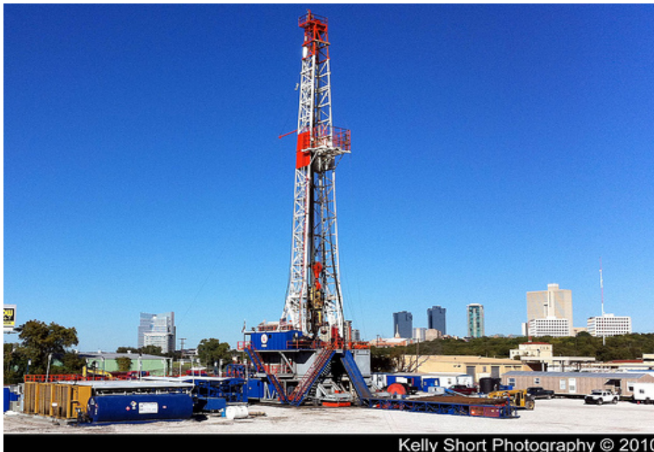
Unconventional shale gas platform located just outside Fort Worth, Texas.

States and the BLM are expending valuable resources issuing hydraulic fracturing disclosure requirements. Companies are spending valuable time submitting disclosures. We should make sure these systems work.